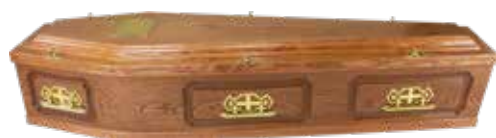
Iona - Oak Veneer (also available in Mahogany Veneer) £720