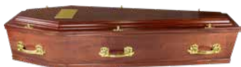
Arran - Mahogany Veneer (also available in Oak Veneer) £595