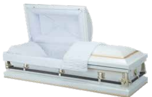
American-Style Caskets* American-style Caskets are available in wood or metal in a wide selection of designs From £1,470