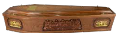
Last Supper £820