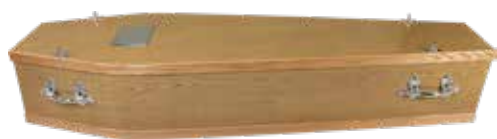
Mull – Oak Effect Foil Veneer £445