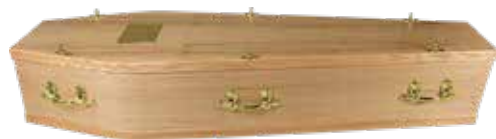
Harris – Oak Veneer £520