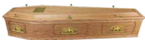
Tiree – Solid Oak (also available in Solid Mahogany) £845