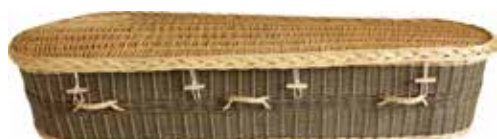
Personalised Willow (Wicker) Hand-woven in the UK, personalised to your specification £1,120