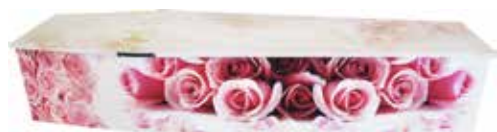
Reflections – Personalised Picture Coffins Choose from a ready-made design or design your own £920