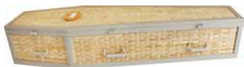
Premium Bamboo* £720