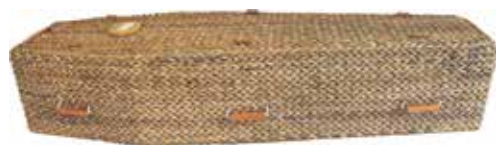
Banana Leaf – Coffin shape* (also available in Casket shape*) £995