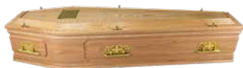
Jura – Solid Oak (also available in Solid Mahogany) £865